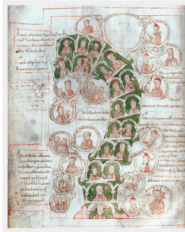
Figure 2: Genealogia Welforum. Hessische Landesbibliothek, Fulda, ms. D.11 folio 13v.

term with no medieval counterpart, a category that brings together works that medieval people would have seen as related; she also mentions other forms of dynastic history, such as family trees (from the 12th century) and family necropolises from the 13th century onwards. Very debatable is her statement on Frutolf, when labelling his history as regnal, as