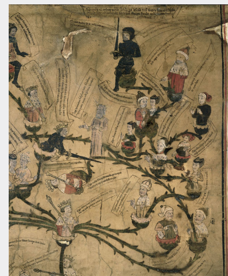
Figure 3: Genealogy of Edward IV (British Library, Harley 7353)

Previous scholarship repeatedly stressed the importance of the late 13th and early 14th century when the Habsburgs acquired a royal status and, unlike the neighbouring dynasties, continued to rule for many centuries to come. 31 Another decisive phase came in the 15th and early 16th century, when a functional system of marriage connections and inheritance treaties gave the dynasty one ruling title after another, without having to fight for it much. As a matter of fact, the Habsburgs came